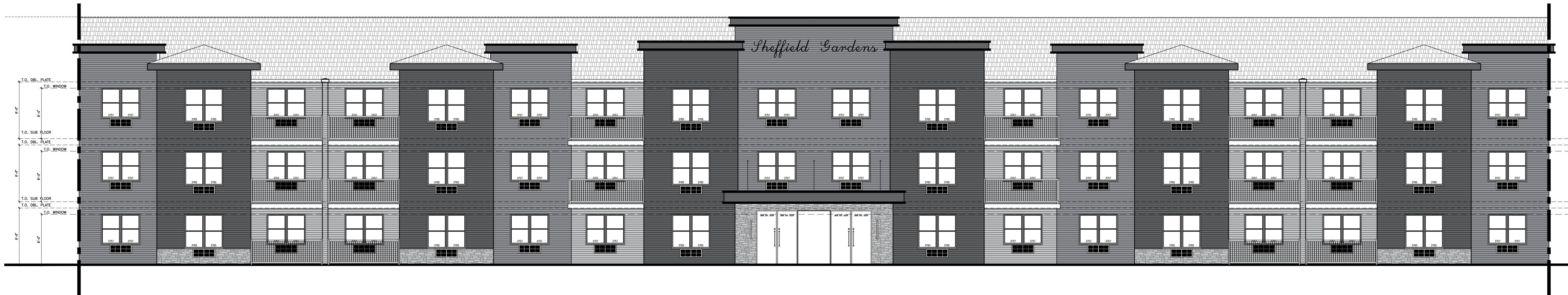
2 FRONT ELEVATION A-201 SCALE: 1/8" = 1'-0"