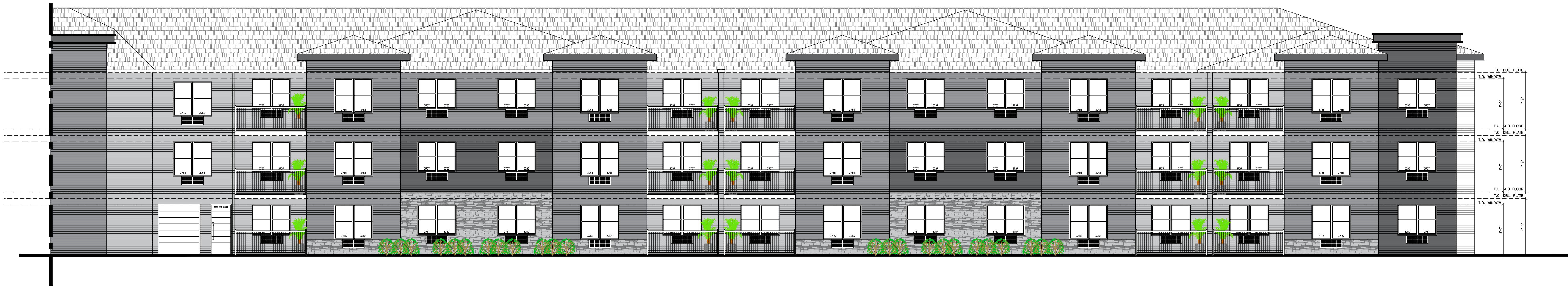
3 FRONT ELEVATION A-201 SCALE: 1/8" = 1'-0"

PROPOSED MULTIFAMILY BUILDING FOR: SHEFFIELD GARDENS RT 17K, TOWN OF MONTGOMERY ORANGE COUNTY, NEW YORK