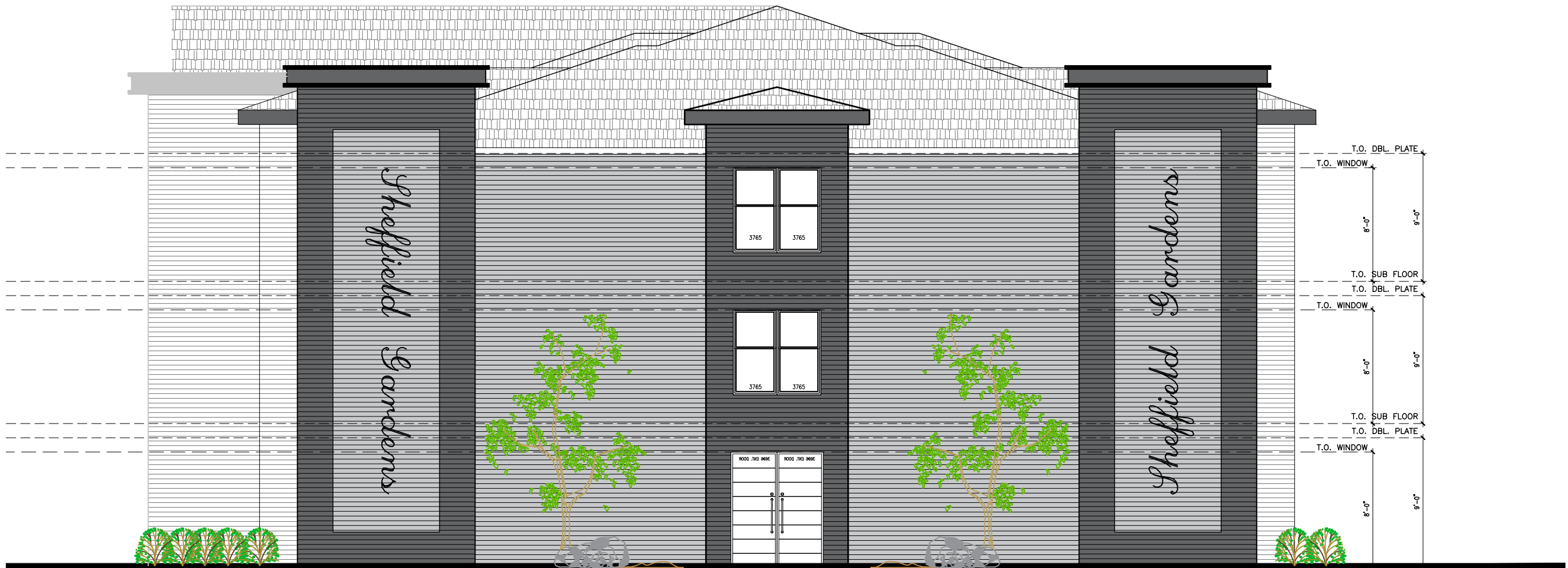
2 A-202 RIGHT ELEVATION SCALE: 1/8" = 1'-0"