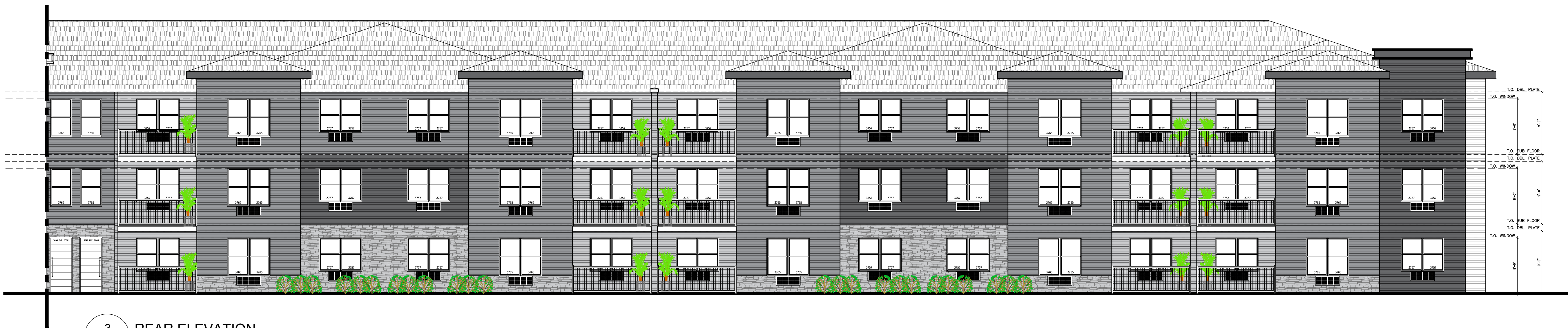
3 REAR ELEVATION A-203 SCALE: 1/8" = 1'-0"