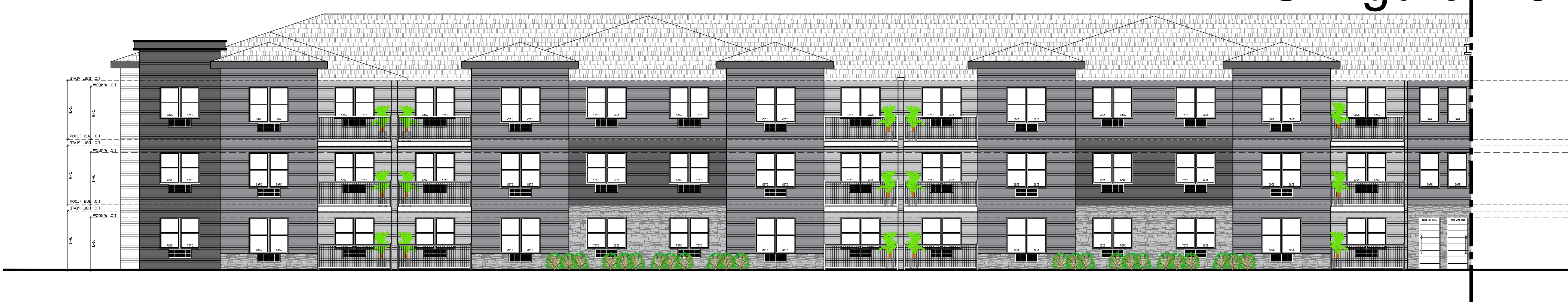
1 FRONT ELEVATION A-201 SCALE: 1/8" = 1'-0"