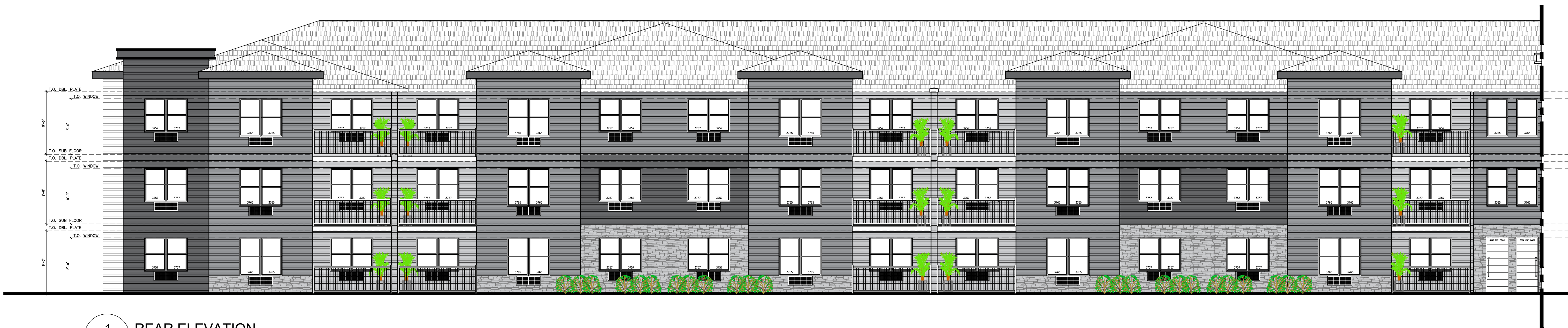
1 REAR ELEVATION A-203 SCALE: 1/8" = 1'-0"