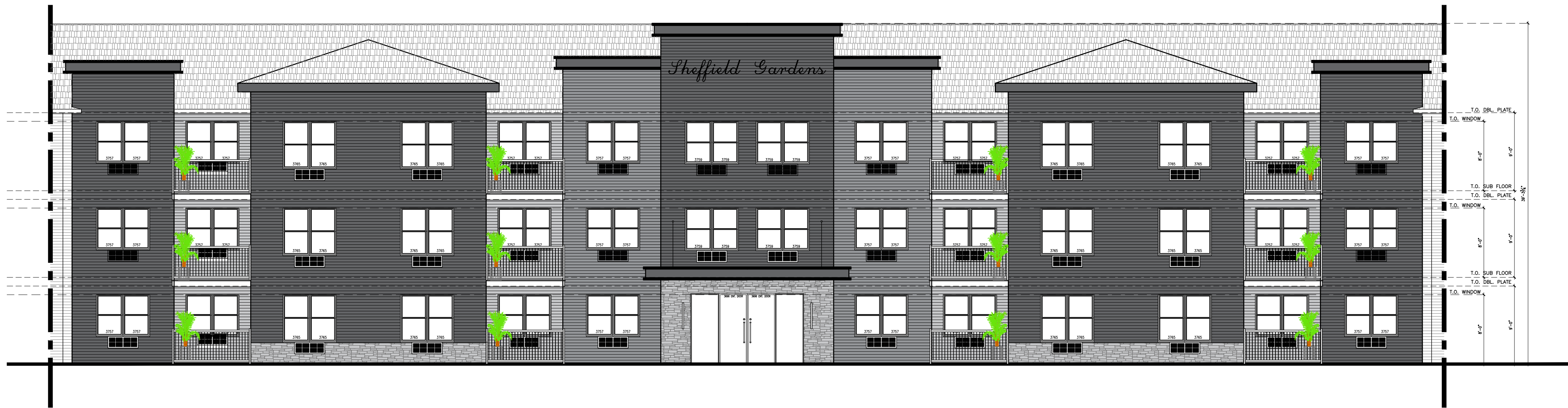
2 REAR ELEVATION A-203 SCALE: 1/8" = 1'-0"